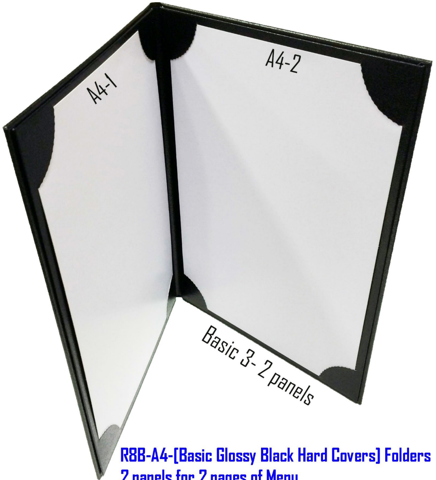
R8B-A4-[Basic Glossy Black Hard Covers] Folders 2 panels for 2 pages of Menu