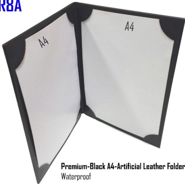
Premium-Black A4-Artificial Leather Folders Waterproof