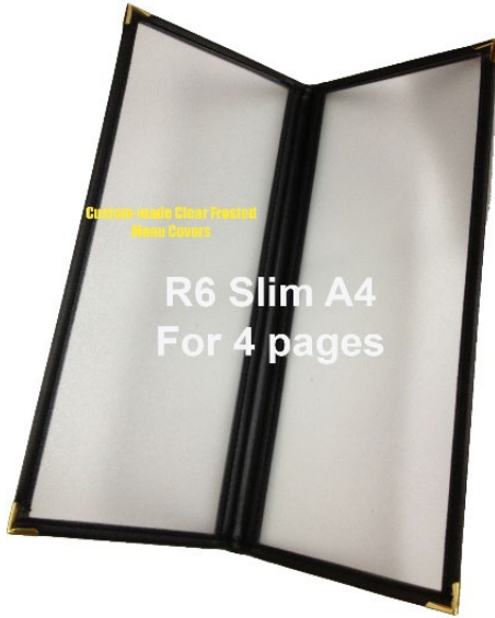
R6 Slim A4 For 4 pages