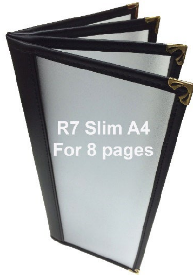
R7 Slim A4 For 8 pages