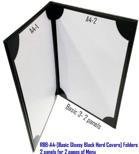
R8B-A4-(Basic Glossy Black Hard Covers) Folders 2 panels for 2 pages of Menu

Ready stocks available, can buy at any quantity